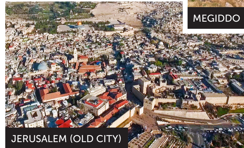
JERUSALEM (OLD CITY)